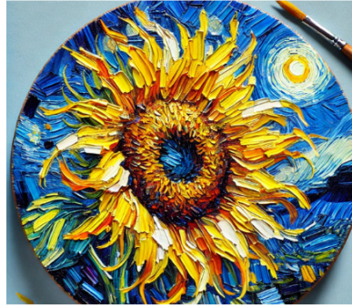
VINCENT VAN GOGH OIL PAINTING, SUNFLOWERS