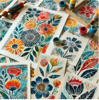
HENRI MATISSE GELLI PRINT COLLAGE