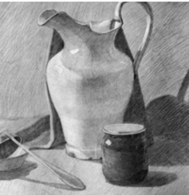
INTRODUCTION TO DRAWING